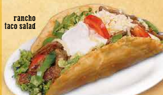
rancho taco salad