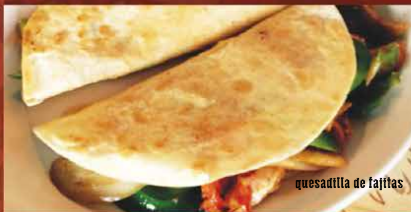
quesadilla de fajitas