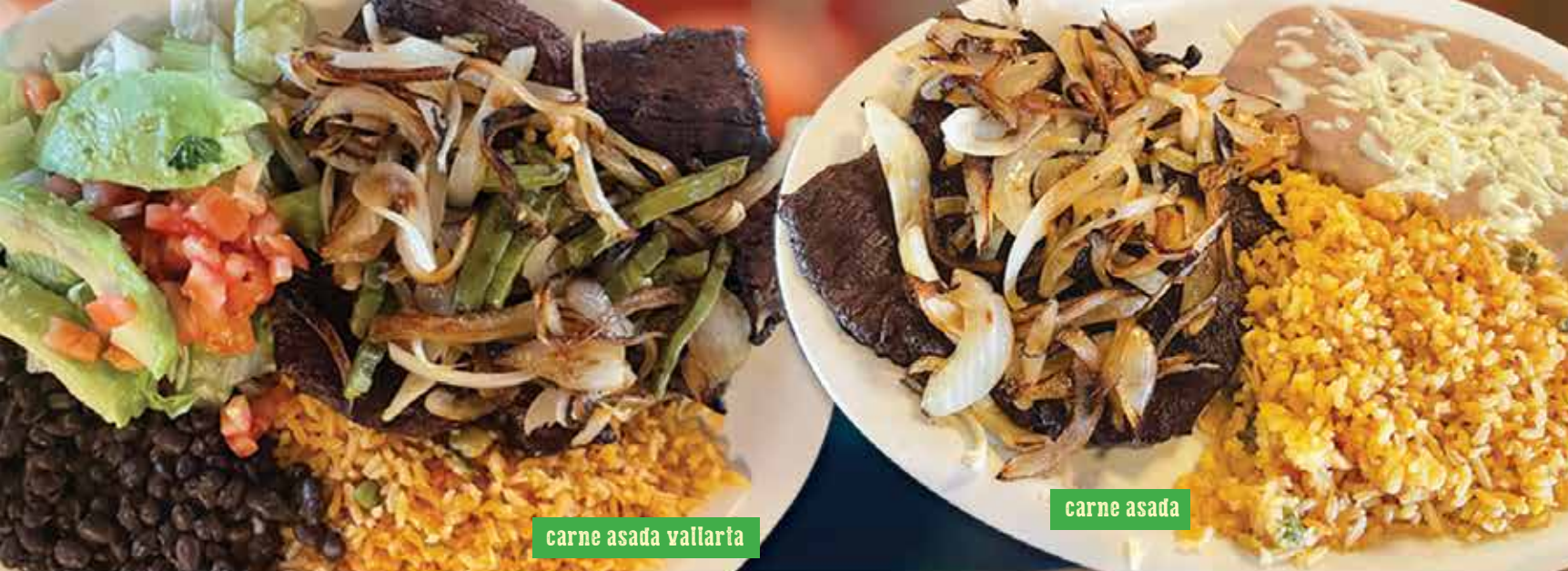
carne asada vallarta