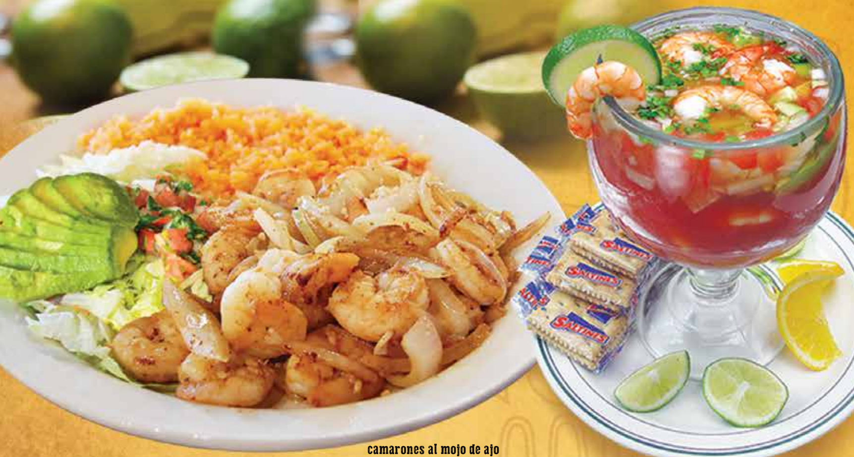
camarones al mojo de ajo